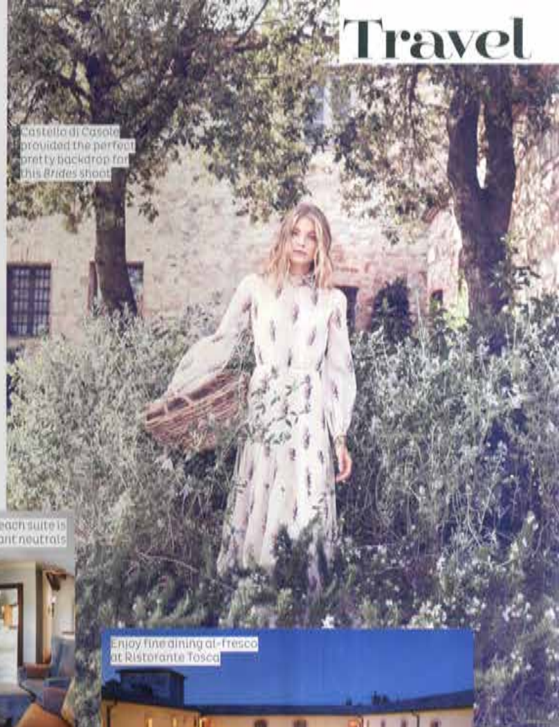
Castello di Casole provided the perfect pretty backdrop for this Brides shoot

Elegant yet casual. Think Sophia Loren all the way – '50s-style bikinis and straw hats for