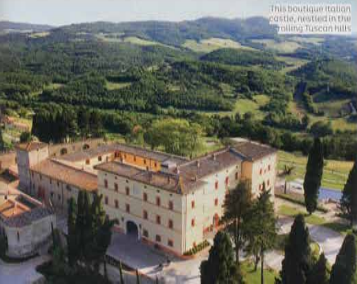
This boutique Italian castle, nestled in the rolling Tuscan hills

WORDS: BRYONY DODD; PHOTOGRAPH: SEAN McMEYER