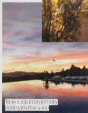
Take a dip in an infinity pool with this view

view doesn't blow your mind, the cocktail will ★ Learning to make pizza and pasta like a pro, alongside wine-tasting with the hotel's expert sommeliers.