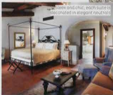
Sleek and chic; each suite is decorated in elegant neutrals

After a meticulous restoration, the 1,000-year-old Castello is an ideal mix of stylish and rustic. The 41 suites are all about rich, earthy colours, ancient stone walls, Murano glass chandeliers and The Princess And The Pea -sized beds combined with huge