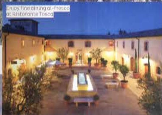
Enjoy fine dining al-fresco at Ristorante Tosca